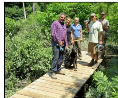
LRPT Volunteers at Sloping Falls in Johnson