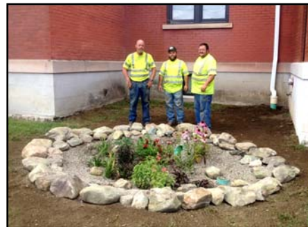
Top photo below: Rain Garden at the Library Bottom: Rain Garden at Park & Ride

LCCD completed three (photos right) Green Stormwater Infrastructure (GSI) projects this fall for and with assistance from the town of Morrystown and the Morrisville Highway Department, thanks to a Lake Champlain Basin Program Grant. One very large project at Morrystown Elementary School resolved a long history of erosion and stormwater runoff near the playground. The other projects included a Rain Garden at Morrystown Centennial Library, and at the new Park & Ride across the street which will be planted this spring with flowering shrubs. Two more projects are scheduled this summer in Morrisville and Hyde Park!