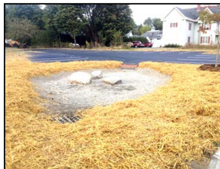
Top photo below: Before at MES Bottom: After Infiltration Gallery