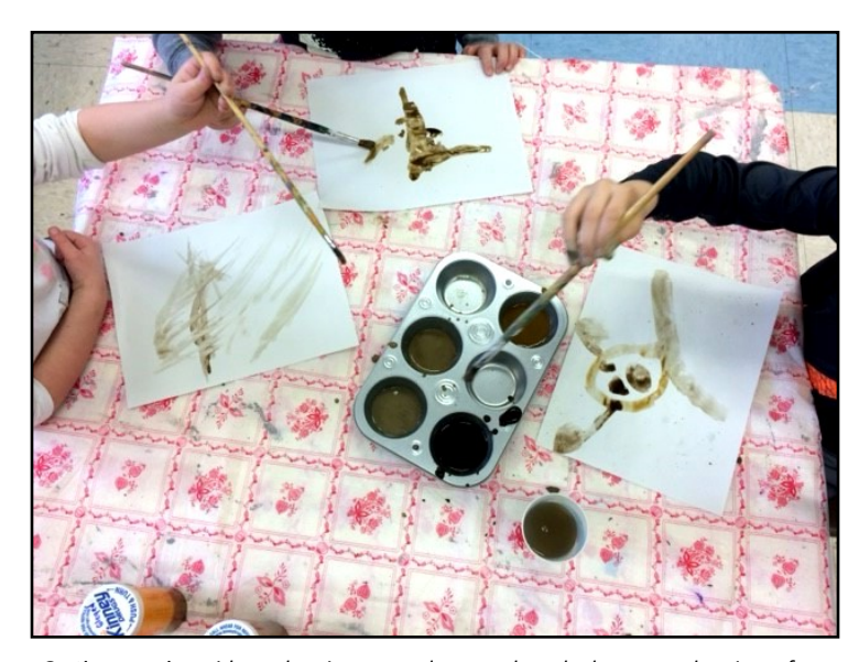
Getting creative with earth paints as students explore the beauty and variety of soil color.

Our most charismatic and accessible of wildlife neighbors, squirrels are industriously and shrewdly preparing for winter this time of year. But are all Vermont squirrels busy burying acorns? We will explore the differences between gray and red squrrels and test our own saver-skills with a nut hunt! Preschool-4th grade. FREE.