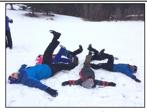
Kindergarten students work on their snowflake symmetry.