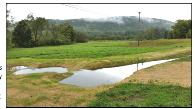
Step Pool Conveyance System off Morey Road

LCCD is happy to report that the Hyde Park Stormwater Improvement Project is near completion! We would like to thank our members, sponsors, and anonymous donations that provide LCCD support to write grants for this project to come to fruition. Without these generous donations, LCCD simply would not be the organization it is in helping neighbors, towns, and schools in the community. LCCD received numerous grants, in-kind services support from the Town of Hyde Park, and blessings from the neighbors to successfully complete the project.