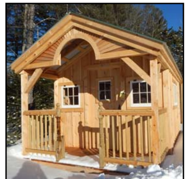
Future Tiny Cabin with Your Help!

We are excited to announce that LCCD plans to place a “tiny” cabin at the Nature Center this summer to shelter campers, offer respite to visitors, and be a back drop for special programs. A lack of a building has always been a need, and an anonymous donation and grants are providing seed funds to start us on this project. Before its official, we need your help in our Tiny Cabin Capital Campaign! We will appreciate any financial donations or in-kind services that will help get the cabin to the camp, and help in preparing the site and the road for delivery. A Nature Center Work Day will be held on June 3rd with hopes for the cabin to arrive June 17th!