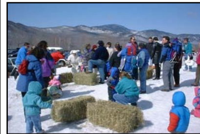
Easter Egg Hunters at Trapp's Family Lodge

At the same time of this hiring, the District started a speaker series, bringing in well-known wildlife biologists, ambassador wildlife species and a hands-on program for the local community. Some might remember when we brought in Mission: Wolf to People's Academy. On their first visit, People's Academy was sold out for two shows and many children at the Morrystown Elementary School were able to meet and howl with wolves. Mission: Wolf continued to sell out crowds for a number of following years. Another fun, well attended, and successful event was the annual Easter Egg Hunt held at Trapp's Family Lodge. Hundreds of children, parents, and grandparents showed up donning their Vermont Sunday best and boots. Now many other organizations host Easter Egg Hunts.